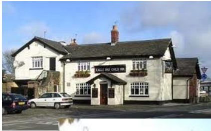
Eagle and Child