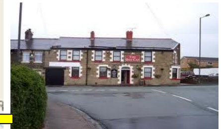
Red Cat Crank