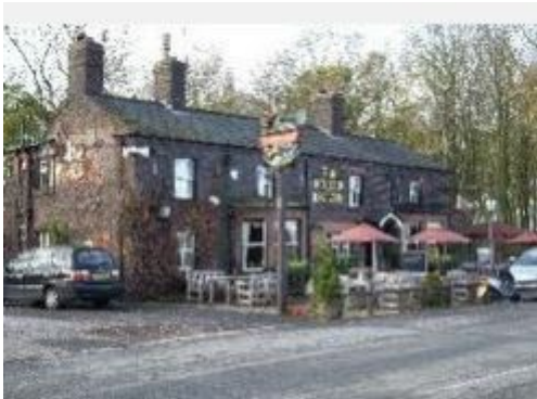
Bottle and Glass